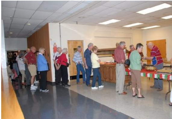
And the line continues