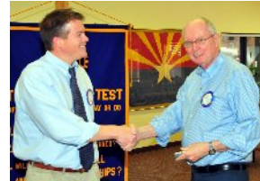
Noble Rose, PH+2,